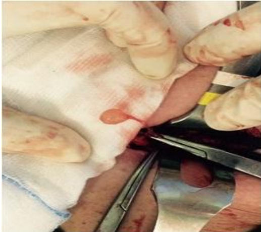
Figure 1: Intraoperative photograph showing the cyst

demonstrated that the mass was hypointense on T1-weighted and hyperintense on T2-weighted series. Diagnosis of cyst of the canal of Nuck was confirmed by surgery and subsequent histopathologic evaluation.